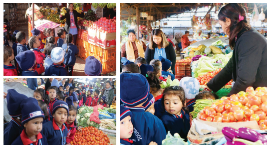
Exploring Knowledge Beyond Text Book